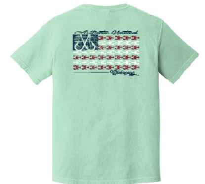
C1717 BLUE JEAN